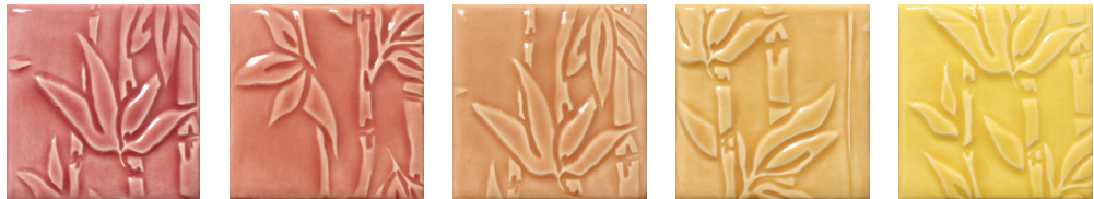
100% C-53 Weeping Plum 75% C-53 25% C-60 50% C-53 50% C-60 25% C-53 75% C-60 100% C-60 Marigold

Customize C-53 Weeping Plum + C-60 Marigold