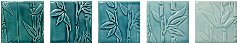
100% C-27 Storm 75% C-27 25% C-11 50% C-27 50% C-11 25% C-27 75% C-11 10% C-27 90% C-11

Head to www.youtube.com/amacobrent and check out our "Volumetric Mixing" video to see how we mix color!